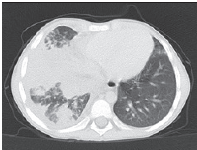
Figure 1. Chest computed tomography of Patient 1, demonstrating possible invasive fungal disease in the lung.

the lung. Unfortunately, he died just after HSCT due to respiratory and cardiac failure. We learned that Patients 2 and 3, in