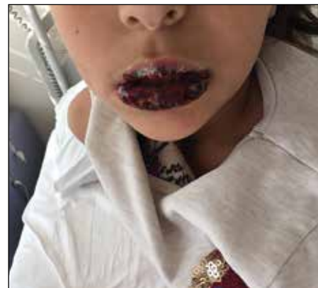
Figure 1(A,B). Skin-pouling, erythematous, plaque-style rash on her face and legs.