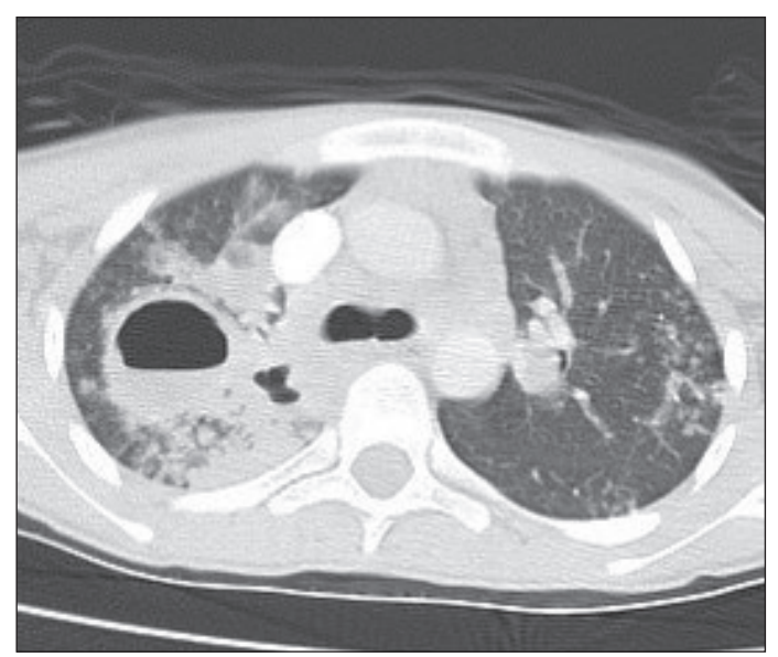
Figure 4. Cavitation in computed tomography of patient 8.

from hospital when control samples showed negative ARB and culture results and their general conditions improved. All patients were treated under direct supervision during hospitalization and ambulatory periods. The total treatment process was continued for 18 months.