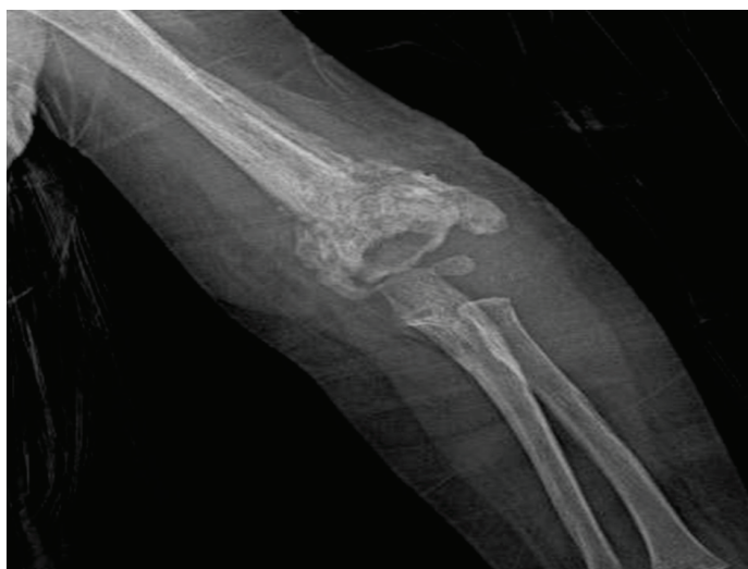
Figure 3. Periosteal reaction described in osteomyelitis seen on direct X-Ray.