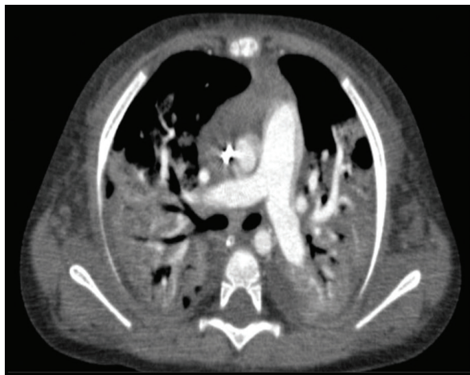
Figure 2. Pulmonary hemorrhage seen on thorax computerized tomography (CT).