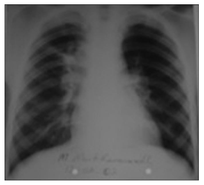
Figure 1. Chest X-ray of the patient showing bilateral hilar lymphadenomegaly

A sterile reactive arthritis that may complicate TB is a less known entity than septic arthritis and is therefore often missed and underdiagnosed. The characteristic different features of septic arthritis and PD are shown in Table 1. Acute presentation of arthritis together with acute onset of TB is the most commonly observed presentation (4). However, in a review of cases, it is stated that six out of seven patients had developed arthritis after initiation of