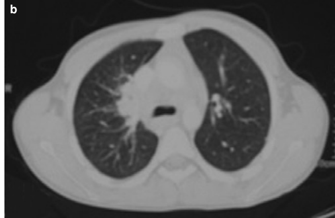
Figure 2. a, b. Primary focus extending from the upper lobe to the apical segment of the right lung, and multiple granulomas on bilateral lungs